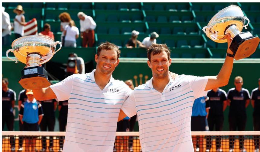
Bob and Mike Bryan extended their team title record to 116 at the 2018 Rolex Monte-Carlo Masters.