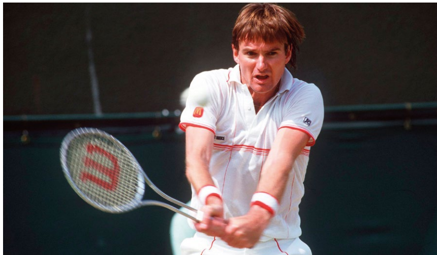
Jimmy Connors leads Roger Federer by 10 titles entering the 2019 season.