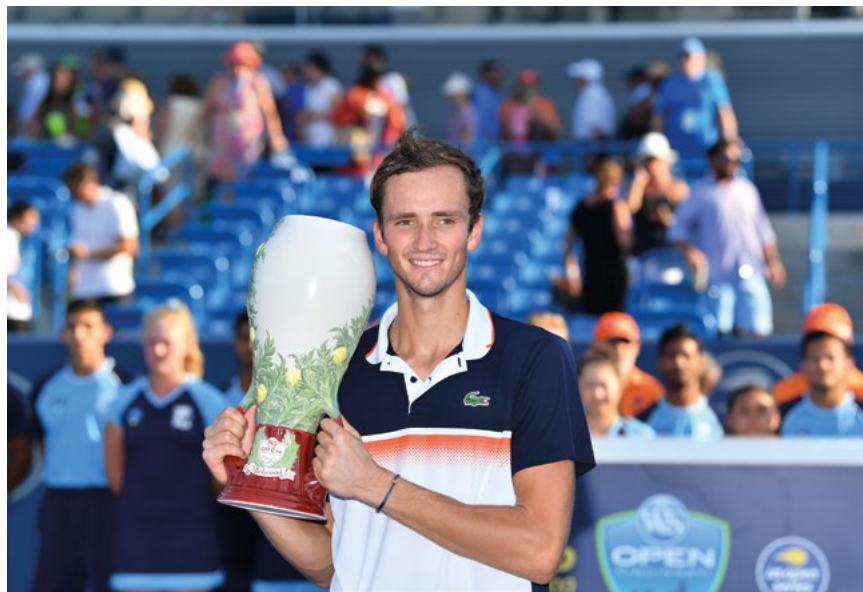
Daniil Medvedev captured his first of two ATP Masters 1000 titles at the Western & Southern Open last summer.