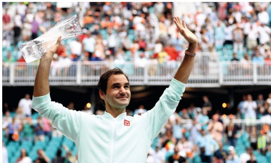
Roger Federer is the oldest ATP Masters 1000 champion in series history, winning the 2019 Miami Open at age 37.