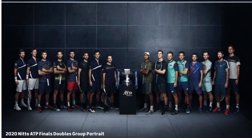
2020 Nitto ATP Finals Doubles Group Portrait