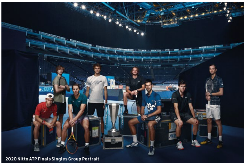
2020 Nitto ATP Finals Singles Group Portrait