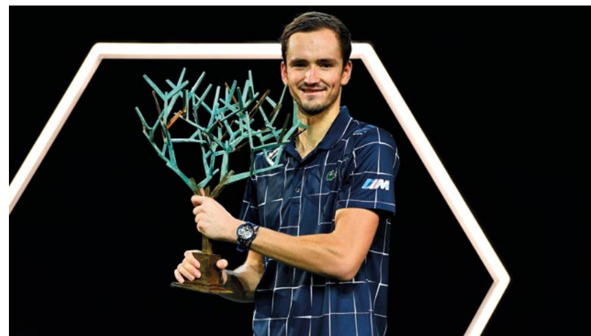
Daniil Medvedev won his third ATP Masters 1000 championship at the 2020 Rolex Paris Masters.