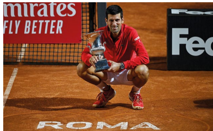
Novak Djokovic set a new record with his 36th ATP Masters 1000 title at the 2020 Internazionali BNL d'Italia.